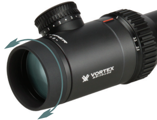
Adjust the reticle focus.

Note: Try to make this particular adjustment quickly, as the eye will try to compensate for an out-of-focus reticle.