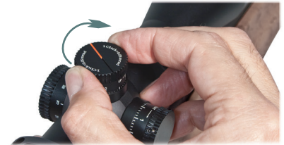
Point at which the knob stops turning.

Turn the elevation knob a partial turn in a counter-clockwise direction until the Radius Bar is correctly aligned with scope axis and zero marks match. This setting will match the original zero point.