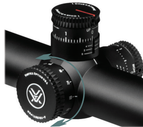
Side Focus Knob

Parallax is a phenomenon that results when the target image does not quite fall on the same optical plane as the reticle within the scope. This can cause an apparent movement of the reticle in relation to the target if the shooter's eye is off-centered. Correctly focusing the target image will allow it to fall on the same optical plane as the reticle within the riflescope.