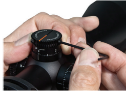
Align the elevation turret cap.

4. Align the turret cap so the “0” mark on the cap matches up with the open slot of the turret shroud and the indicator line on the scope body. Again, be sure not to rotate the actual turret mechanism in the process.