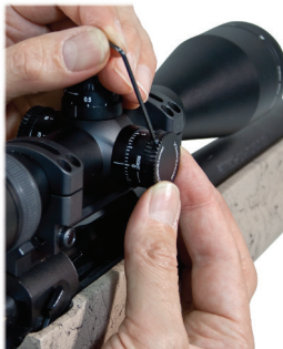
Align the windage turret cap.

Once the windage and elevation knobs are correctly indexed to the zero mark, temporary corrections can be safely dialed into the scope without worry of losing the original zero.