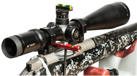
Using bubble levels to square the riflescope to the base.