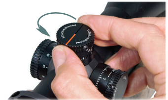
Correct alignment for zero point.

Note: If re-zeroing at a future time, be sure to remove all CRS shims before sight-in.